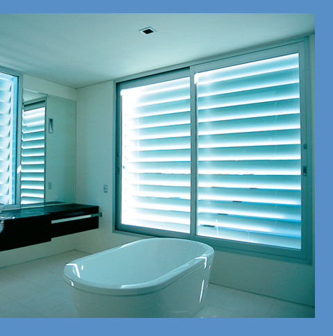
Corners The dramatic affect of Bracket Fixed 120 Airfoils, with mitred-cantilevered corners.